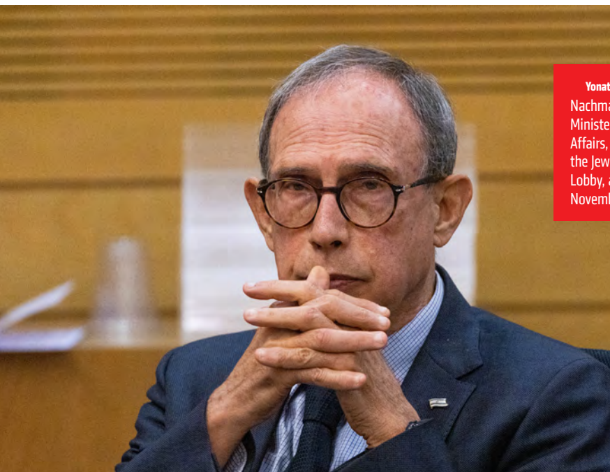
Nachman Shai, Israel's Minister of Diaspora Affairs, attends the Jewish People's Lobby, at the Knesset, November 15, 2021.